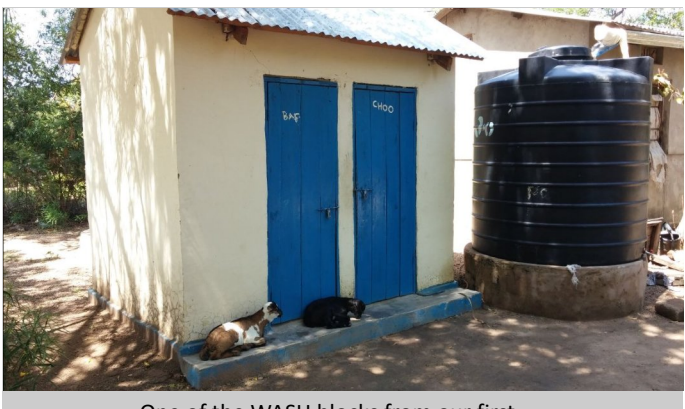
One of the WASH blocks from our first water and sanitation project.

Safe drinking water and hygienic waste disposal are everyday essentials that we take for granted. Our longterm partner, Upendo Care and Counselling, was approached to provide toilets and rainwater collection tanks in village locations. We might not value a squat toilet cubicle shared by more than 30 people, but for these people it is heaven. The toilet or "choo" is so highly valued that the key is closely guarded. <u>Steve</u> <u>enjoyed making another video.</u>