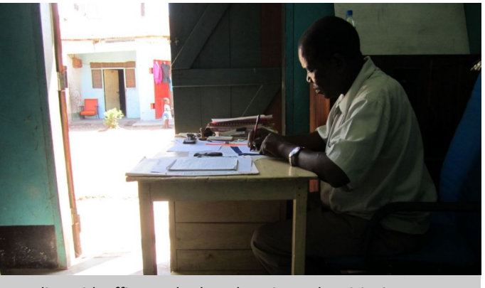
Dealing with office work when there is no electricity in Mwanza.

In 2008 we helped to set up a microcredit scheme at an NGO in Mwanza called BCDSA. We didn't really know what we were doing, but we took advice and were able to help our partner.